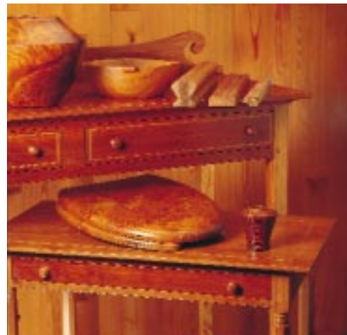
Far left: From contemporary to traditional styling, Heart Pine adds beauty and value to any room in the home.