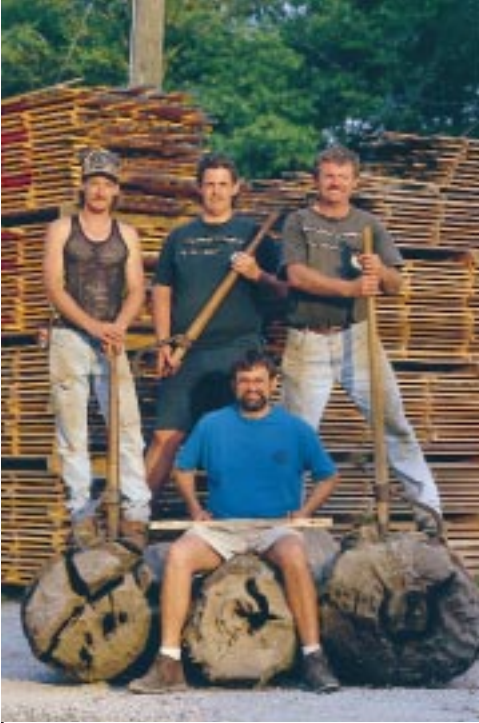
Goodwin Heart Pine: River-Recovered Heart Pine Specialists

“We work with wood that has been lost once and presumed gone forever . . .”